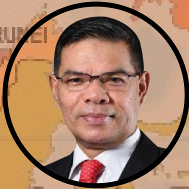
Y. B. Datuk Seri Saifuddin Nasution bin Ismail Minister of Home Affairs, Malaysia