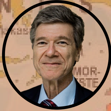
Prof. Jeffrey D. Sachs Director of the Centre for Sustainable Development, Columbia University, USA and the Jeffrey Sachs Centre for Sustainable Development, Sunway University, Malaysia