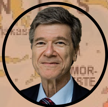
Prof. Jeffrey D. Sachs Director of the Centre for Sustainable Development, Columbia University, USA and the Jeffrey Sachs Centre for Sustainable Development, Sunway University, Malaysia