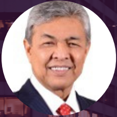
Y.A.B Dato' Seri Dr. Ahmad Zahid bin Hamidi Deputy Prime Minister & Minister of Rural and Regional Development