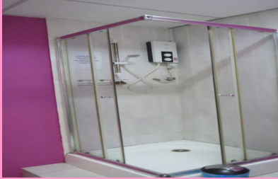
1st Floor Office Space – 1359 sq ft