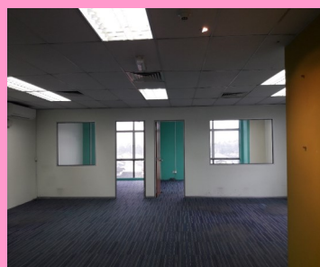
3th Floor Office Space – 2137 sq ft