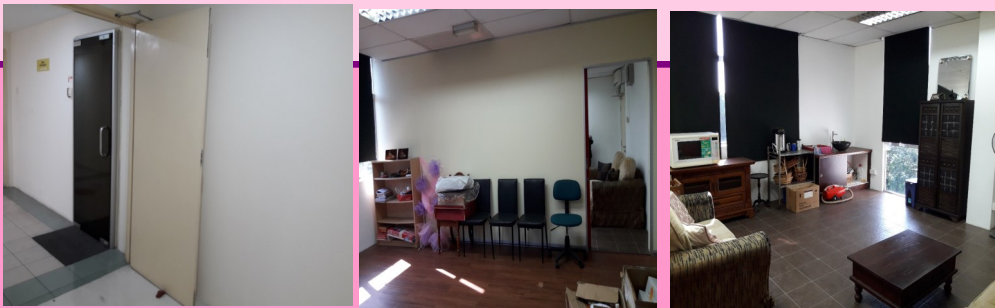
4th Floor Office Space – 472 sq ft