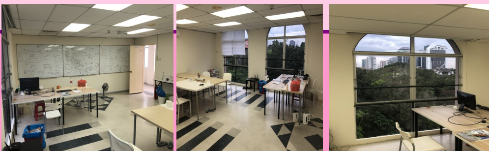
5th Floor Office Space – 442 sq ft